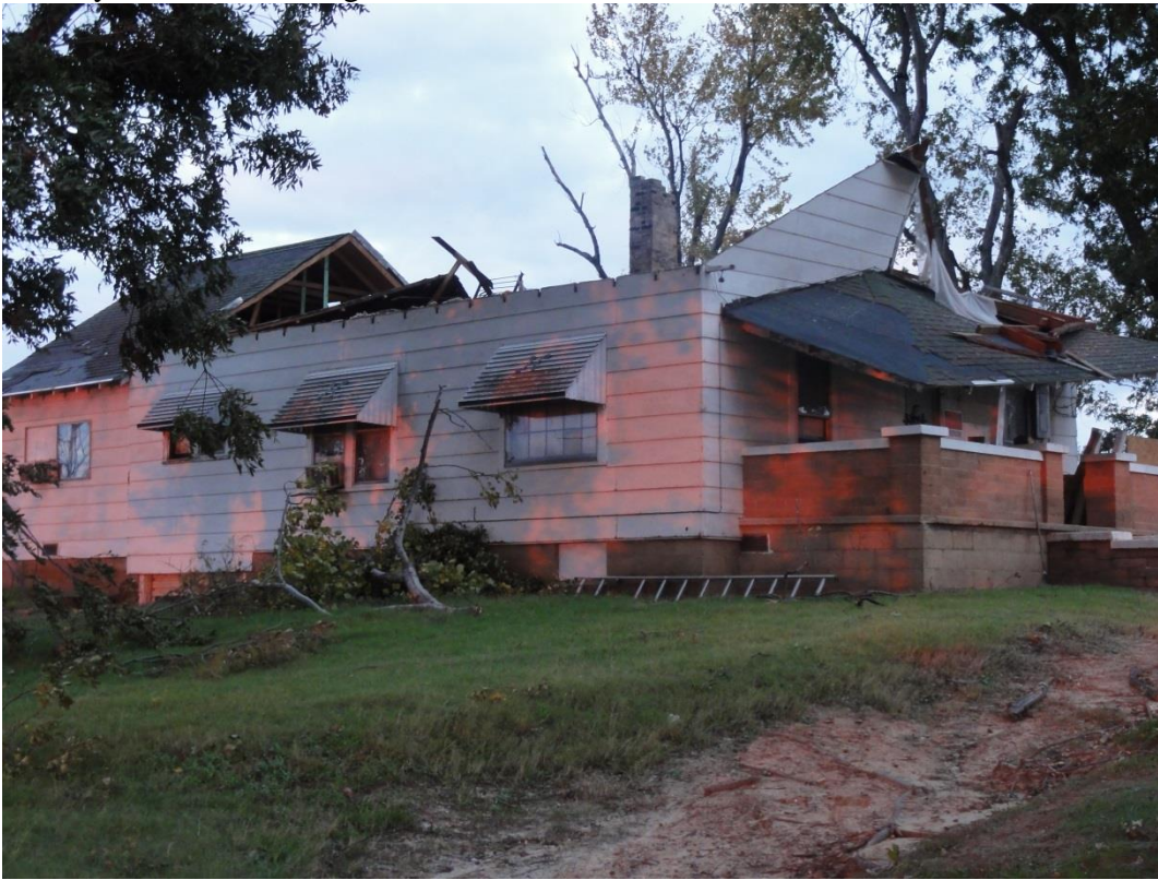
Brosely, MO EF1 Damage