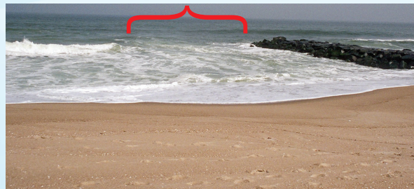
Rip currents often form near coastal structures.