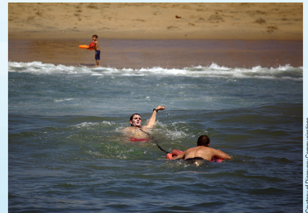
A lifeguard rescues a swimmer caught in a rip current.