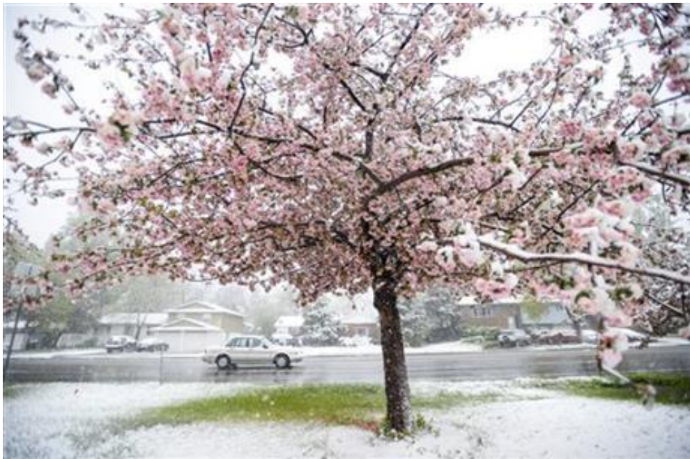
Figure 3: Snow falling on a blossoming tree in Fort Collins, CO on 11 May, 2014