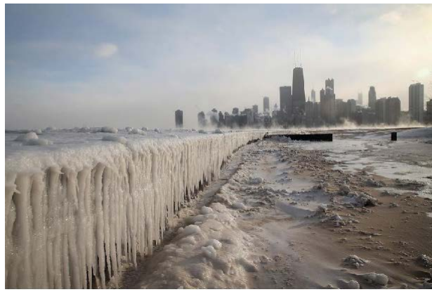
Figure 2: Photograph of Lake Michigan during the height of the arctic intrusion