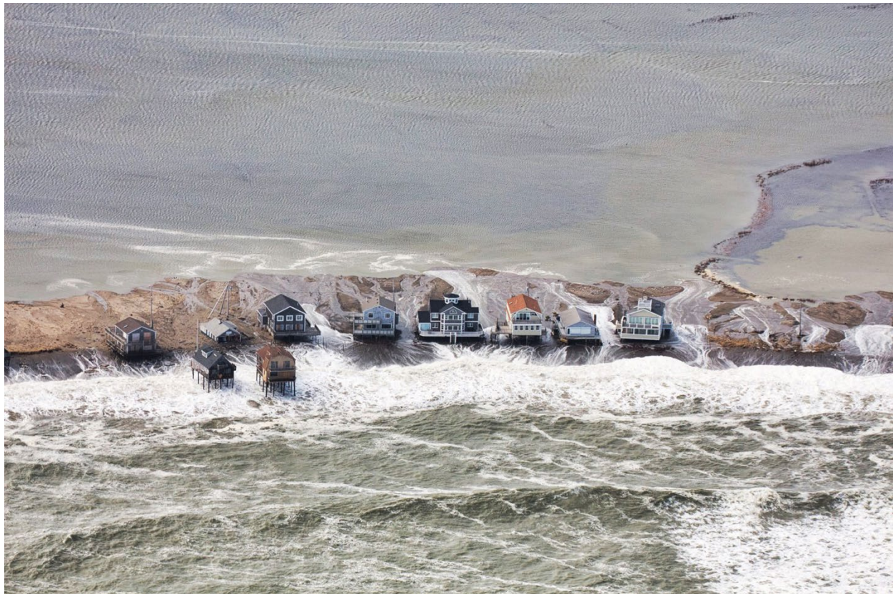
Fig. 2 – Coastal flooding in Peggotty Beach, Scituate, MA on 04 March