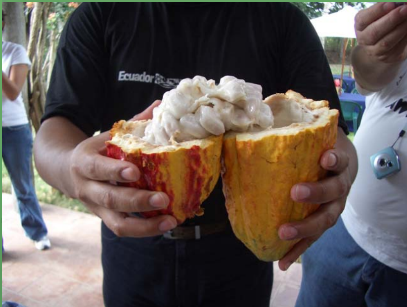
A cacao fruit--What chocolate is made of!

Ecuador's agricultural center is in the coastal region. Many crops are grown including bananas, one of Ecuador's largest exports.