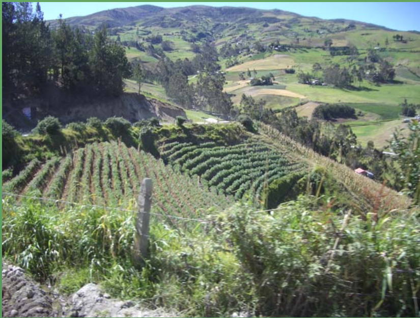
A potato field

Much land is devoted to agriculture in Ecuador to feed its population of over 13 million. The main crops include rice, corn, potatoes, and soybeans.