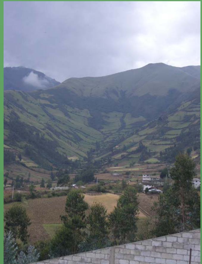
Terraced land outside Quito