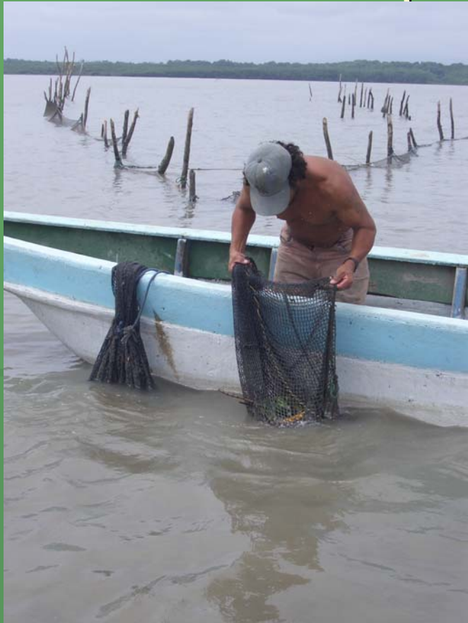
A fisherman checking his nets

Fishing is very common along the coast. There are also many shrimp, tilapia, and crab farms built along the coast. Often mangrove forests have been destroyed to make room for aquaculture.