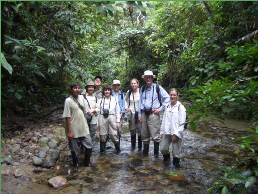
A hiking trip with local guides

More tourists are coming to the Amazon as more roads and airports are making it easier for them to reach the region. People from across the world come to experience the Amazon and meet its people.