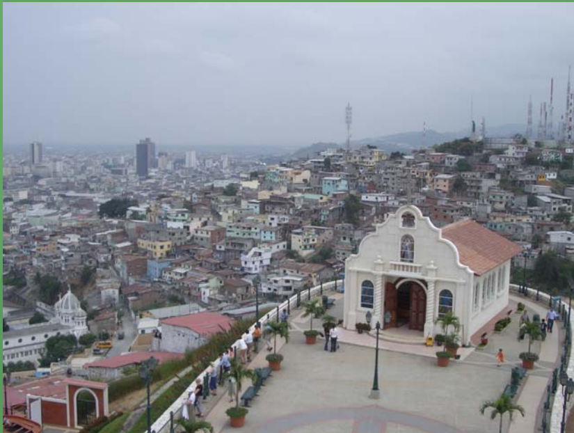
A view of the crowded port city of Quayaquil.

The coast is a very diverse region home to Ecuador's largest city of Quayaquil, vast agricultural lands, and coastal resources.