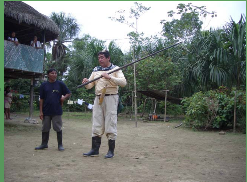
Learning to shoot a blow gun from a local hunter