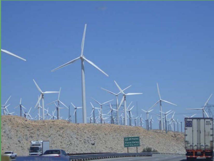
Windmills for energy outside of Palm Springs, California.

People in the United States have also changed their environment.