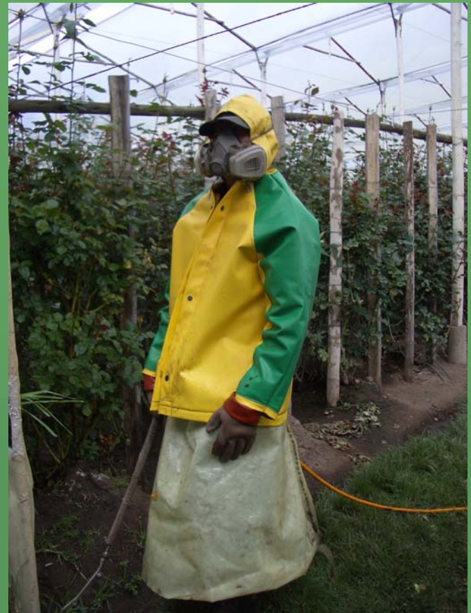
Man responsible for applying pesticides to the roses.