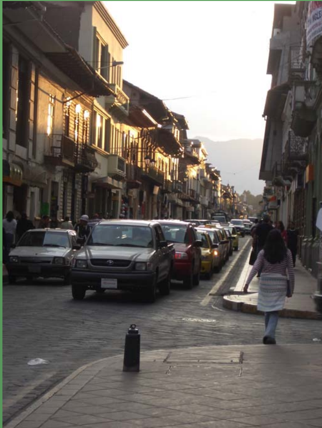
One of Cuenca's busy streets. The Andes are visible in the background.

Cuenca is Ecuador's second largest city in the Highlands behind Quito. It was colonized by the Incas and then by the Spanish in the 1500s. It has kept much of its European colonial architecture.