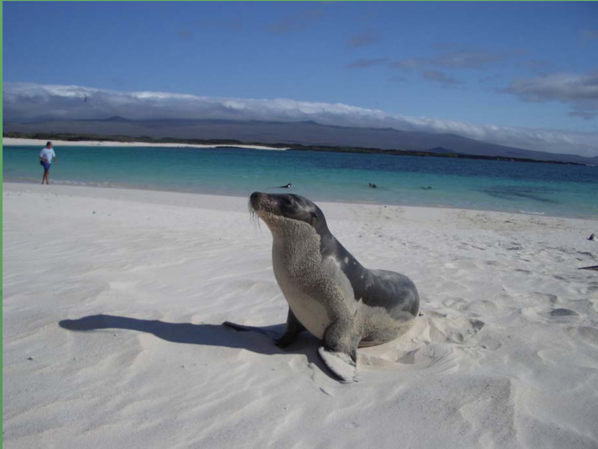
A friendly sea lion