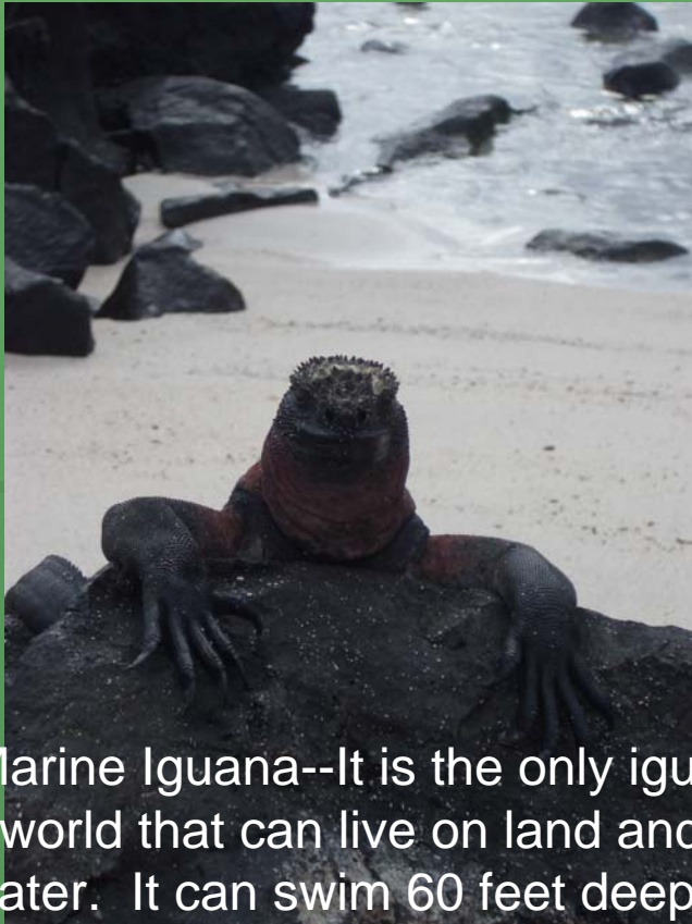
A Marine Iguana--It is the only iguana in the world that can live on land and in the water. It can swim 60 feet deep and hold its breath for up to an hour.

The islands are 600 miles from mainland Ecuador so they have been largely protected from human interference until recently. Today the human population is growing quickly--26,000 people live on the islands now.