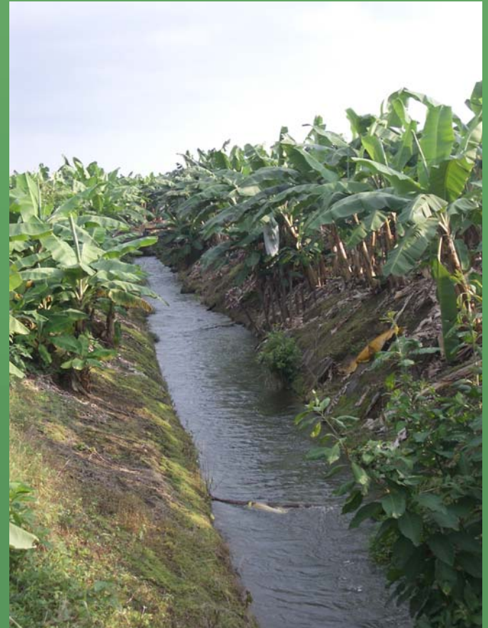
Irrigated Banana Plantation