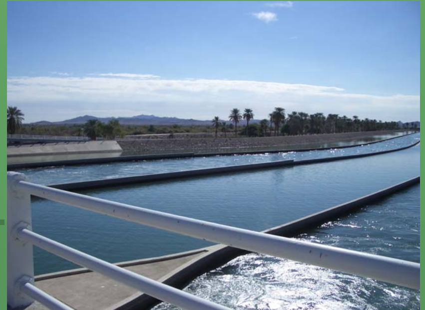
The Imperial Dam in California, controlling the flow of the Colorado River for downstream consumption.