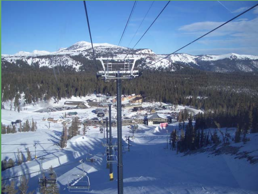
Ski chairlift at Mammoth Resort, California.

Humans have and will continue to change their environment. Today we must STOP and THINK how we can make more responsible changes with fewer negative consequences on our environment.