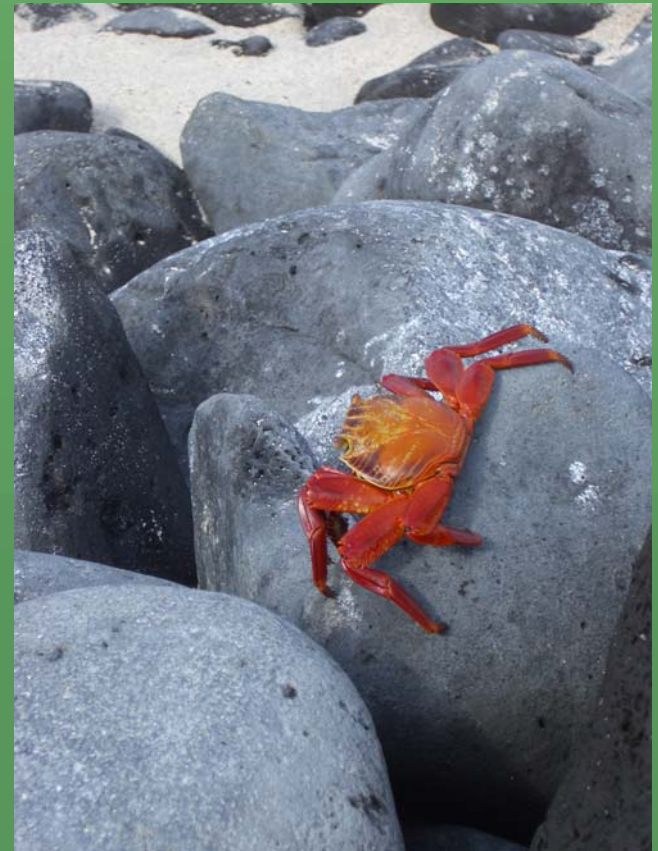
A colorful crab!