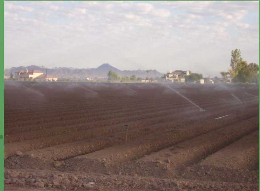
Irrigated Fields of Yuma, Arizona.