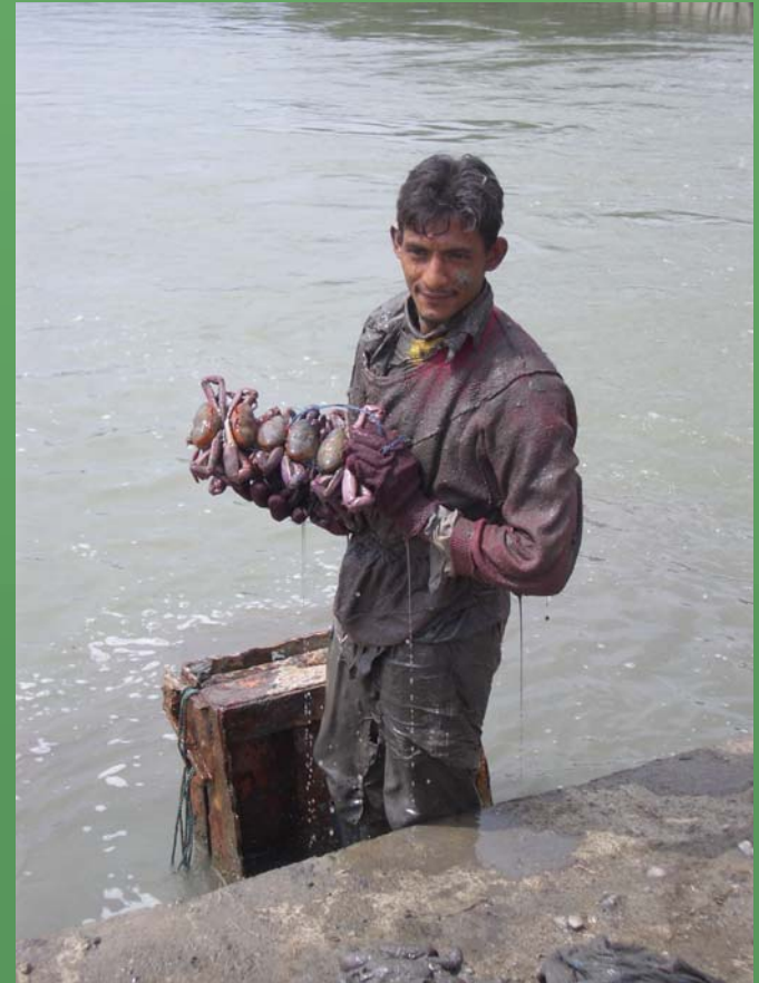
A bundle of captured crabs