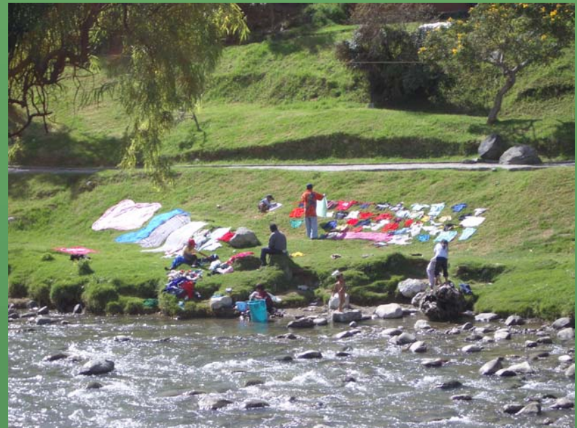
Families do laundry in one of the four major rivers that run through Cuenca.