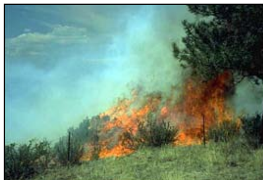
Figure 1. Fire spreads vertically through vegetation (Anchor Point Group, Boulder, CO).