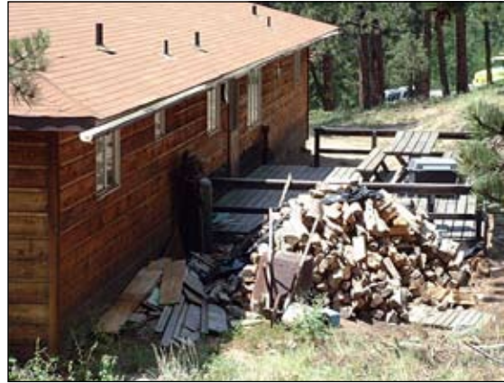
Figure 2. Combustible materials adjacent to a building create a hazard (Anchor Point Group, Boulder, CO).