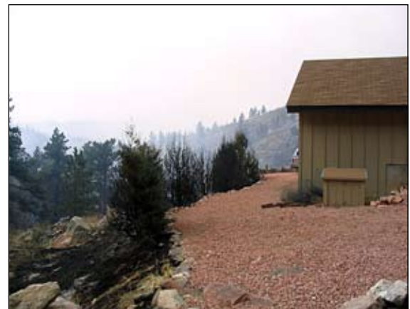
Figure 4. A noncombustible ground cover in Zone 1 helped this home survive a wildfire.