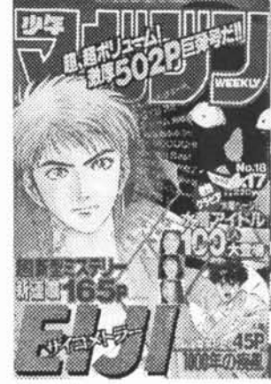
(c).mangagin b (color)