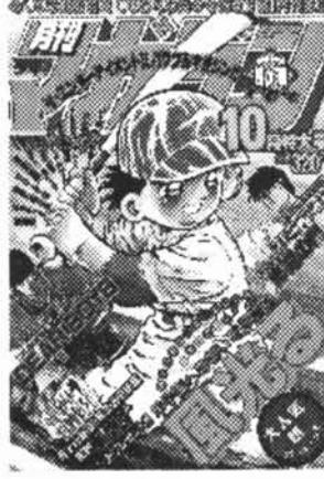
(b).mangagin a (grey scale)