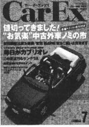
(a).carex (grey scale)