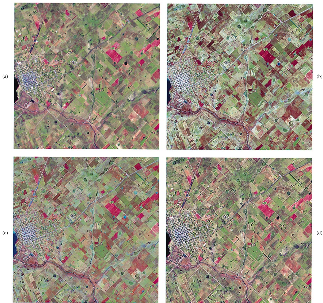
Fig. 2. (a) Detail of the LANDSAT (TM) image. (b) Result of the fusion by the standard IHS method. (c) Result of the fusion by the standard LHS method. (d) Result of the fusion by the additive wavelets on L component (AWL) method.

and rivers. The images were registered and the SPOT image was photometrically corrected to present a histogram similar to the L component of the LANDSAT image. Then, we applied the AWL image fusion technique and compared the results to those given by the standard methods.