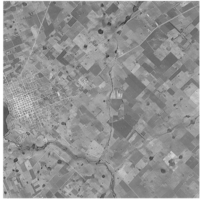
Fig. 1. Detail of the SPOT image.

The last four lines of Table I show the correlation between the R, G, and B bands of the additive wavelet-based solutions (AWRGB, AWI, AWL', and AWL) and the same bands of the original LANDSAT (TM) at 30-m resolution. Note that the correlations of all the additive wavelet-based solutions are clearly higher than the correlations of the standard solutions. This means that the additive wavelet solutions preserve the spectral characteristics of the multispectral image to a greater extent than the standard IHS, L'HS, and LHS solutions.