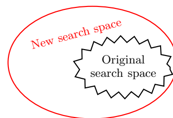
Figure 1: The Basic Approach

Roughly speaking, one way to show how more data can reduce the training runtime is as follows. Consider learning by finding a hypothesis in the hypothesis class that minimizes the training error. In many situations, this search problem is computationally hard. One can circumvent the hardness by replacing the original hypothesis class with a different (larger) hypothesis class,