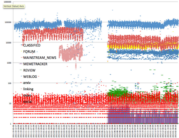
Figure 1: Hourly document counts for TREC KBA Stream Corpus 2013 sources (Frank et al., 2013).

into sentences and annotated for named entities using the Stanford tagger. The document counts per hour for each composite “source” type is shown in Figure 1. The major types of document in the corpus are newswire articles, social media data aggregated from blogs and forums, and linking records from Bitly.com.