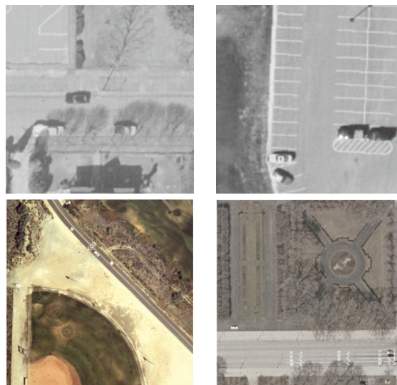
Figure 1. Typical images from the OIRDS dataset. Small size vehicles have any orientations. Shadows, highlights and complex textured background make the task very challenging.

Manifolds are good candidates to model accurately small targets. If a target size is e.g. 40 \times 40 pix-