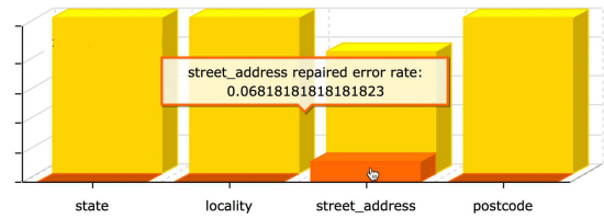
Figure 7: Repair statistics.