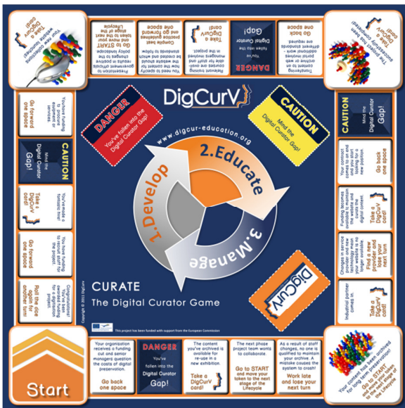
Figure 2. The CURATE! gameboard

Two years on from the development of the game, a survey was carried out by TCD and MDR Partners on the uses of the game, and the reception the game has received. This survey was designed for completion online, and was made available from April 2013. The survey has, by and large, reinforced anecdotal comments made to the game developers. The results so far indicate that the game has been played across Europe, as we already knew from conversations with players, as well as in the USA and Australia. In Europe, the game has been played in Belgium, Germany, Ireland, Italy, The Netherlands, Spain and the UK. In the United States, we found an instance of the game being played in New Hampshire, and in Australia we received feedback to the survey from Canberra (see Figure 3). The game received exceptionally good feedback online, especially among Twitter users.