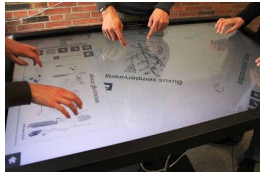
Figure 3: Cooperative Multitouch-based Learning

Figure 3 shows a group of students annotating and discussing learning material on a multitouch table.