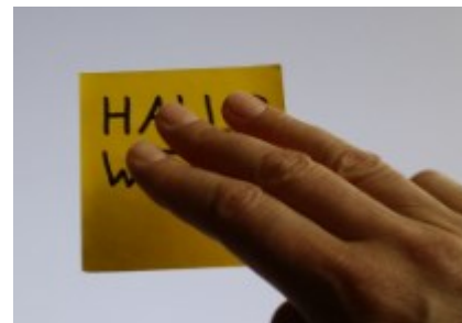
Figure 4: Augmented Note

Figure 4 shows an augmented note on a multitouch table. By a specific gesture the camera is triggered and an electronic version of the note is integrated in the learning process.