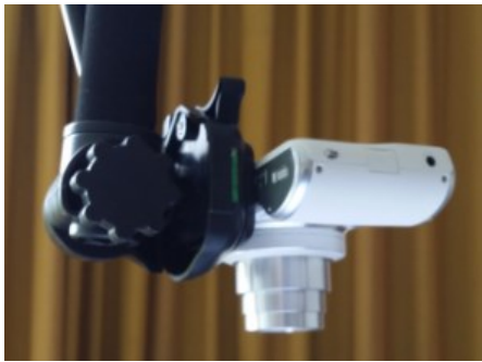
Figure 1: Camera Setup for Multitouch Table

In addition, this approach utilizes augmented notes [12] by integrating a camera in the environment. Figure 1 shows a camera setup, which we are currently using above a multitouch table in order to take pictures from the display triggered by a specific gesture. In this way, a paper-based document can be put on the table and automatically integrated in the electronic hypermedia.