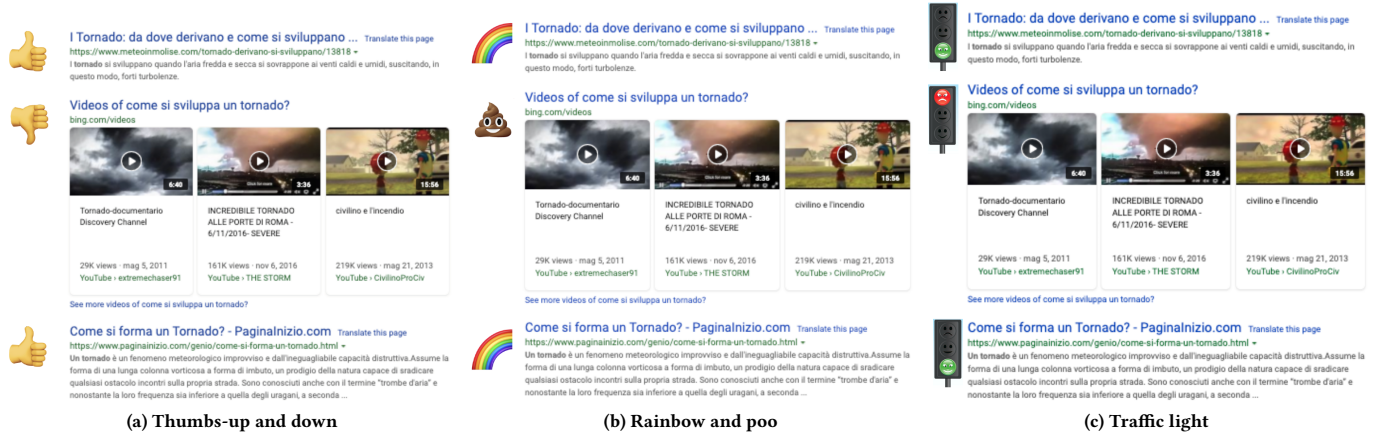
Figure 1: Three mock-up designs utilizing different emojis to enrich a SERP.