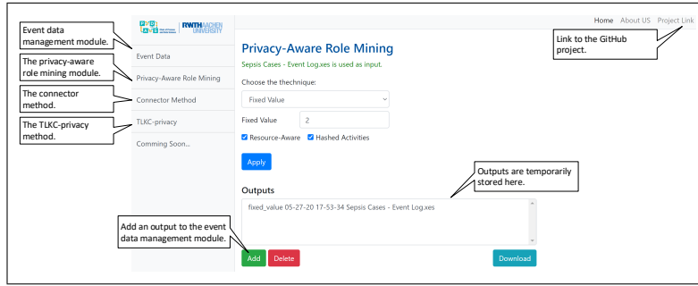
Fig. 2: The privacy-aware role mining page in PPDP-PM.

for the privacy preservation techniques. The privacy-aware role mining module (Figure 2) implements the decomposition method supporting three different techniques: fixed-value , selective , and frequency-based [6]. After applying a technique, the privacy-aware event log in the XES format is provided in the corresponding “Outputs” section. The generated event log preserves the data utility for mining roles from resources without exposing who performs what.