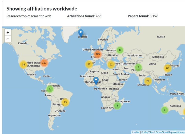
Fig. 2. Map visualization of affiliations publishing works matching “semantic web”

search is matched on paper and/or conference/journal titles. When the search button is clicked a map visualization is rendered as shown in Figure 2. The map shows all of the affiliations that have at least one publication in the results. If there are multiple affiliations nearby in the map, a cluster will be displayed with the number of affiliations in the cluster. As the user zooms in on a particular region, the clusters will become more fine-grained until markers are associated with only one affiliation. If such a marker is clicked, the number of matching publications and a list of publications are shown for that affiliation.