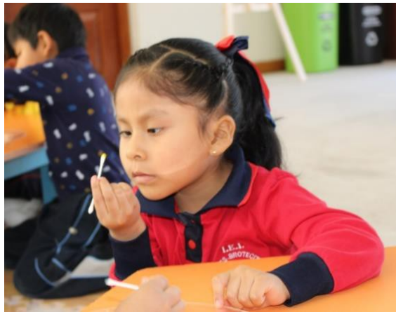
Figure 6. Indagation Sector

Note: Students testing their hypotheses about whether milk has fat, through experimentation. Own Preparation