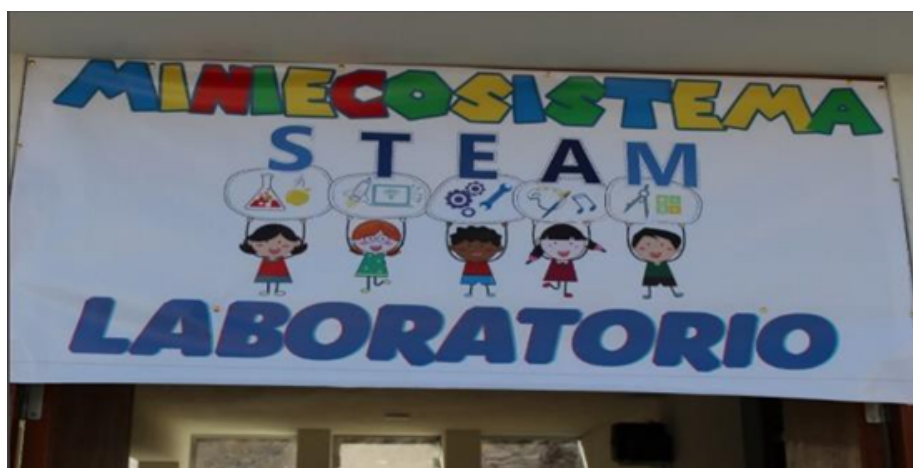
Figure 17. STEAM Mini Ecosystem Laboratory

Note: Entrance to the STEAM Miniecosystem Laboratory. Own elaboration