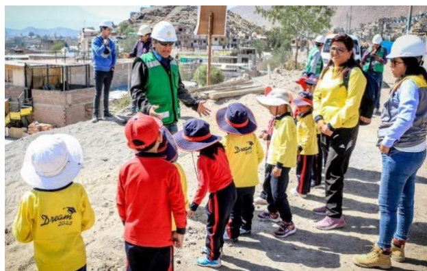
Figure 9. Construction Sector

Angely: “I saw a news story on TV, that with the rain a wall was falling” (Example posed from the collection of comments from 5-year-old children from the EI. Sweet Sprouts.)