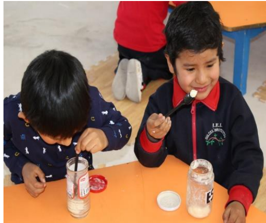
Figure 8. Research Sector

Note: Student creating new flavors for homemade butter. Own preparation.