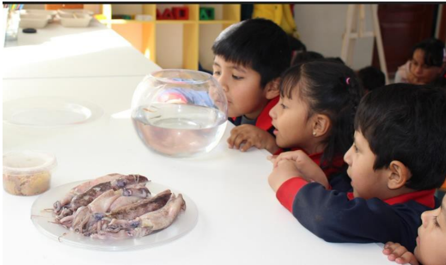
Figure 1: Indagation sector

Eyal: "surely with the ink he hides from his enemies" (Example raised from the collection of comments from 4-year-old children of the IE. Dulces Brotectitos)