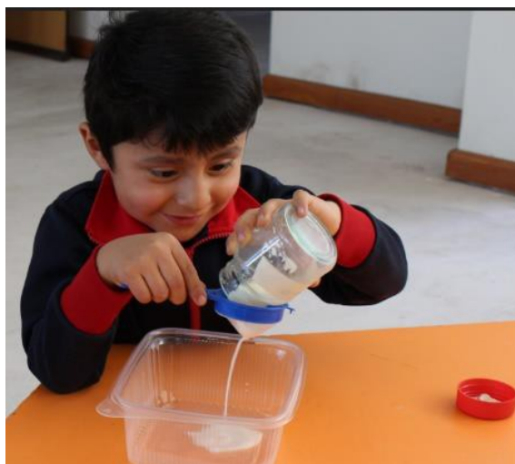
Figure 7. Research Sector

Note: Student testing his hypothesis about whether milk has fat, through experimentation. Own preparation