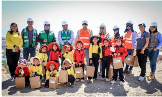
Figure 10. Construction Sector

Note: Students, engineers, teachers finishing the field visit to the retaining wall work Own preparation.