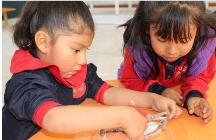
Figure 3: Research Sector

Note: Students observing the squid using their senses. Own Preparation