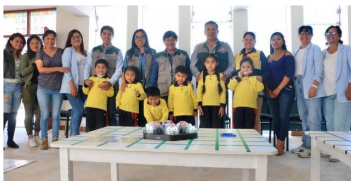
Figure 18. STEAM mini-ecosystem

Note: Entrance to the STEAM Miniecosystem Laboratory. Own elaboration