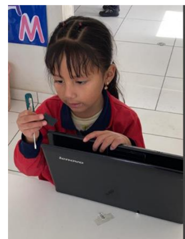
Figure 11. Pedagogical Dumpster Sector

Note: Student, in the process of disassembling a laptop. Own elaboration.