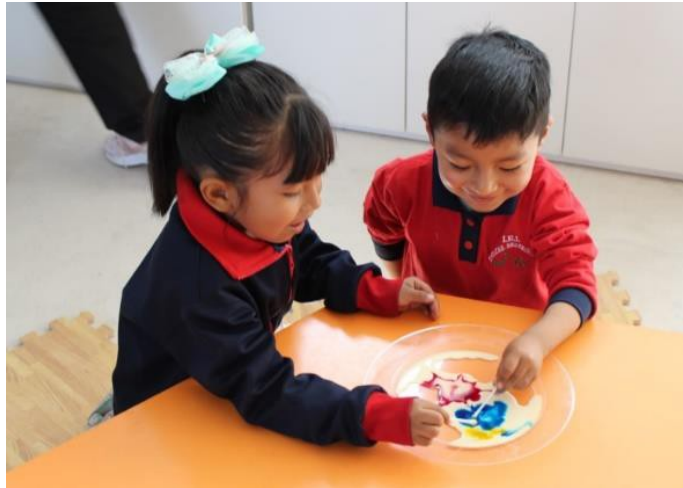
Figure 5. Research Sector

Note: Students testing their hypotheses about whether milk has fat, through experimentation. Own Preparation