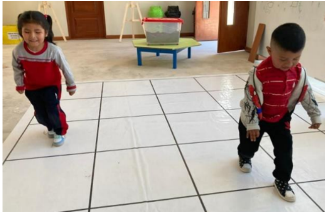
Figure 14. Robotics and programming sector Note: Students making trajectories on the large grid. Own elaboration.