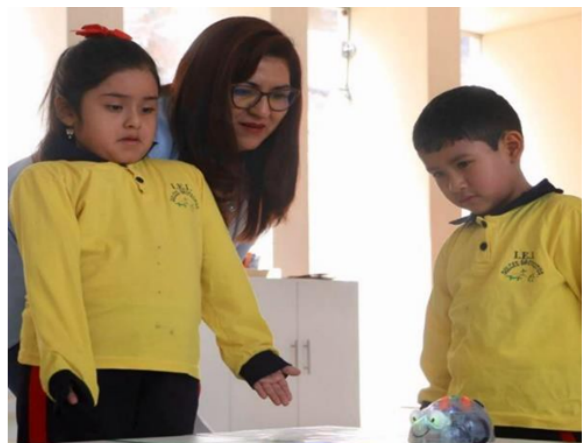
Figure 15. Robotics and programming sector Note: Students carrying out trajectories programming the Blue Bots. Own elaboration