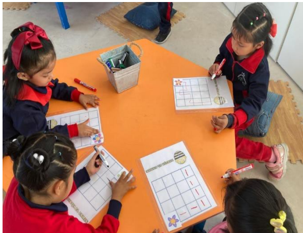
Figure 16. Robotics and programming sector Note: Students carrying out different trajectories on cards with different challenges to reach a goal. Own elaboration