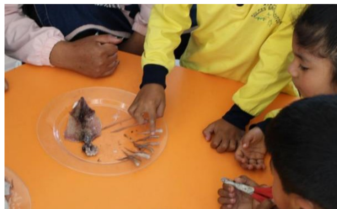
Figure 4: Research Sector

Note: Students manipulating and discovering what the body of the squid is like. Own preparation