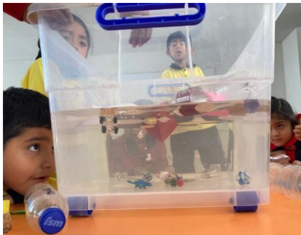
Figure 21. Research sector experience

Note: Children writing and drawing their hypotheses about objects that do not float. Own elaboration.