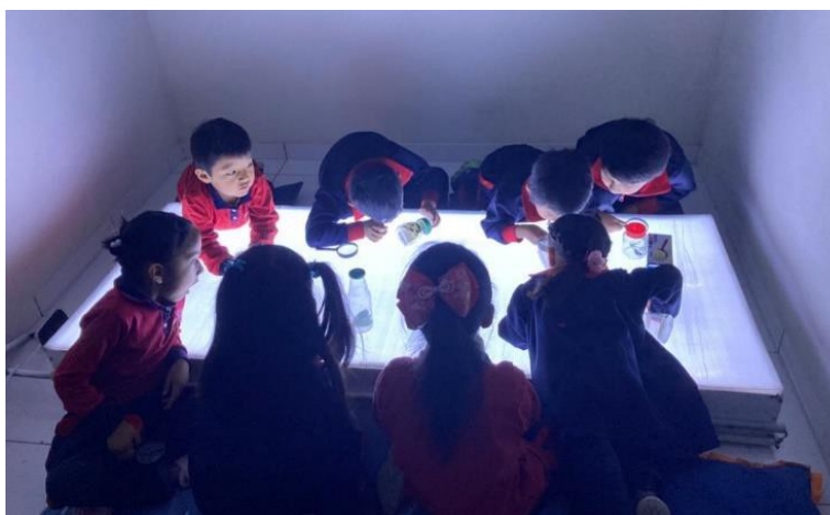
Figure 13. Sensory Tables Sector

Note: Students at the light table, experimenting with colors. Own elaboration.