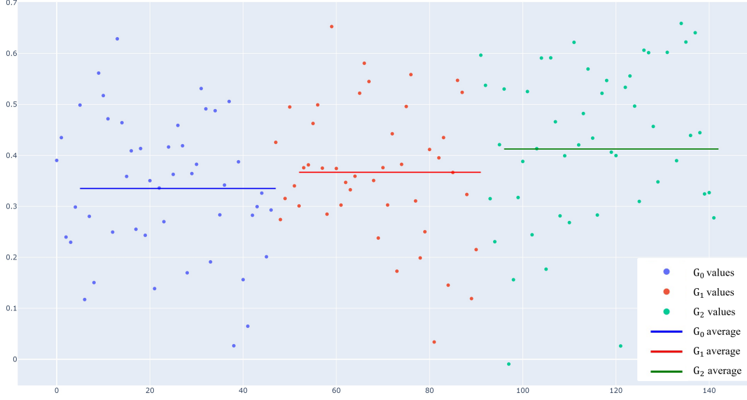
Figure 3: Values and averages of G_0 , G_1 , and G_2 based on cosine similarity.

To evaluate our assumption and determine which similarity metrics are more effective in aligning with users' assessments of entity relevance to their contexts, we applied a one-way ANOVA (Analysis of Variance) test. The one-way ANOVA is used to determine whether an independent variable has an effect on a dependent variable. In our case, the independent variable is the entity's relevance to the context, which is categorized as 0 (irrelevant), 1 (relevant), or 2 (representative). The dependent variable is the average pairwise semantic similarity between all entities and representative entities within each context. The one-way ANOVA test produces an F-statistic, which is then used to calculate the p-value. The p-value helps us decide whether to reject or fail to reject the null hypothesis ( H_0 ), which states that there is no statistically significant difference between the pairwise semantic similarity within the representative entities of a context compared to their similarity to other entities within the same context. Conversely, the alternative hypothesis ( H_1 ) posits that representative entities are semantically closer to each other. We denote the average pairwise semantic similarities for each group by G_i :