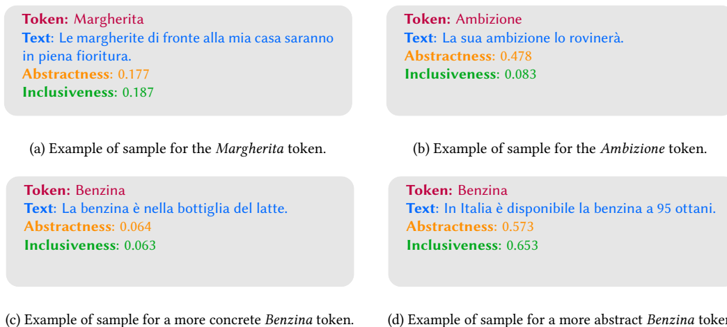
Figure 1: Examples from the abricot dataset.

of the ideas (namely, only colorless green ones), while the reference in 2b shows a higher level of inclusiveness, not distinguishing among them on the basis of their color.