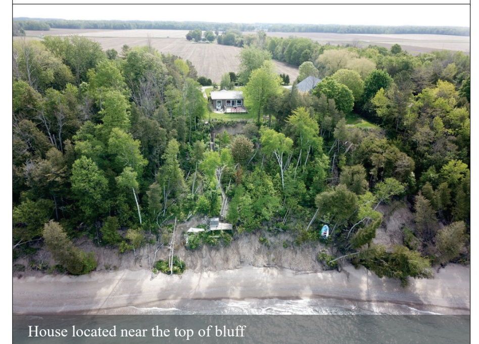
House located near the top of bluff