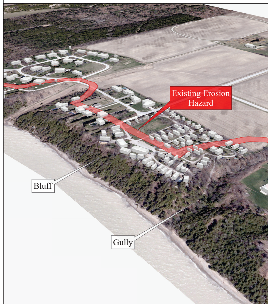
3D perspective of existing erosion hazard (to be updated as part of on-going study)