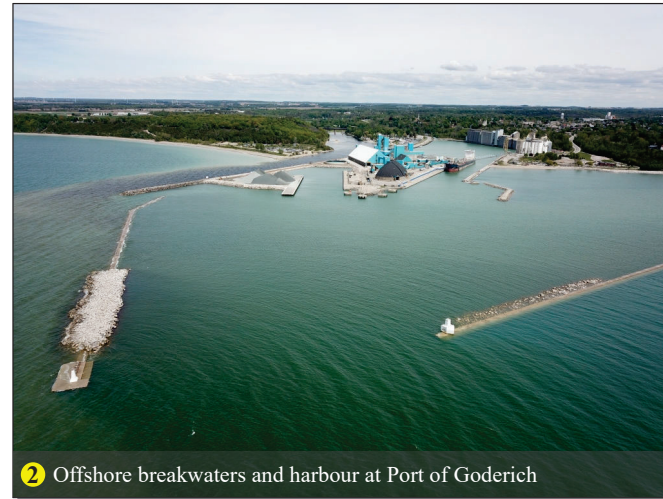
2 Offshore breakwaters and harbour at Port of Goderich