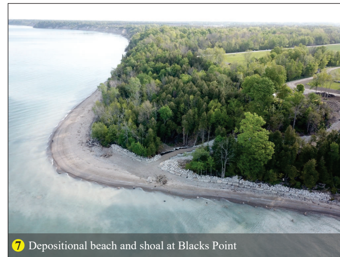
7 Depositional beach and shoal at Blacks Point