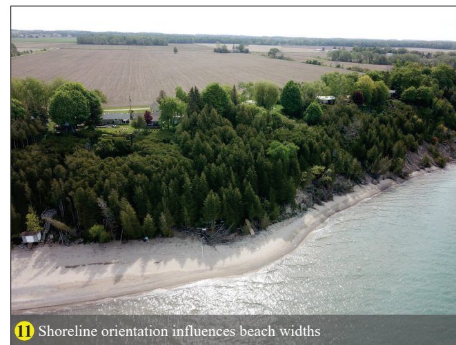
11 Shoreline orientation influences beach widths