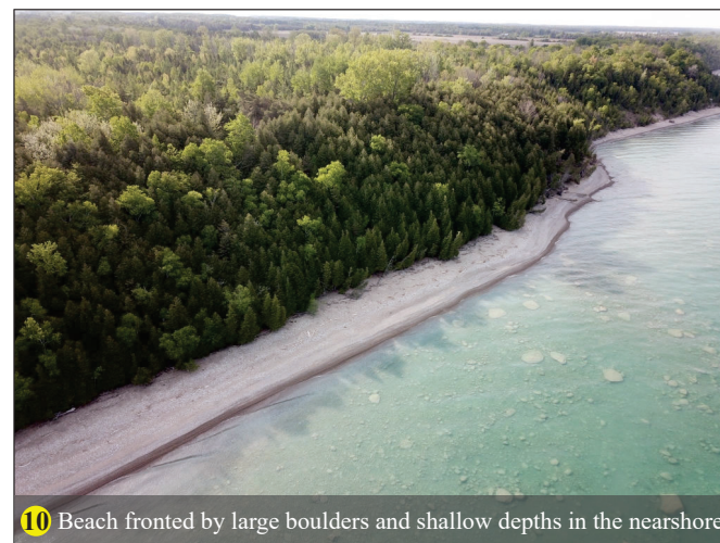
10 Beach fronted by large boulders and shallow depths in the nearshore