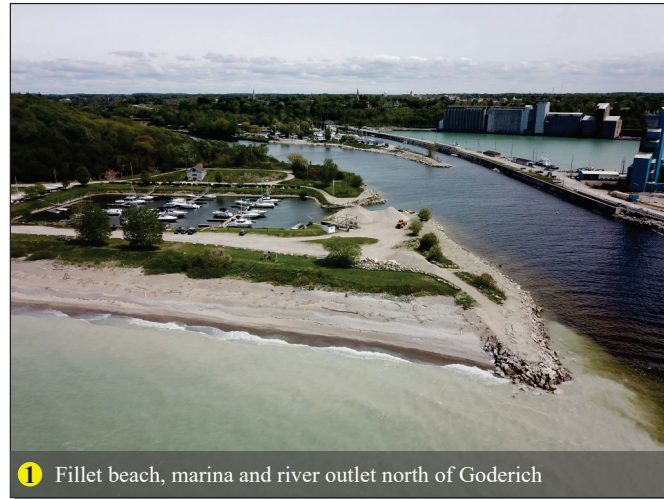
1 Fillet beach, marina and river outlet north of Goderich