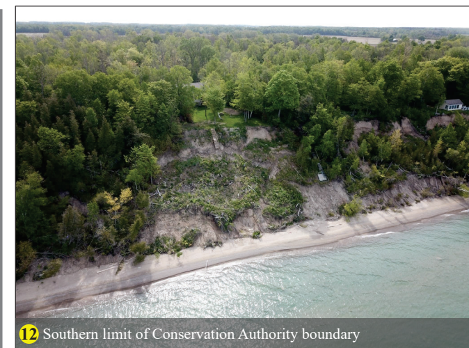
12 Southern limit of Conservation Authority boundary