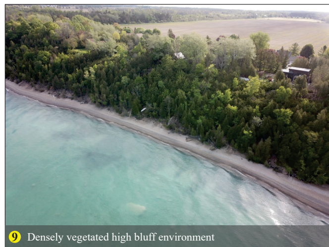
9 Densely vegetated high bluff environment