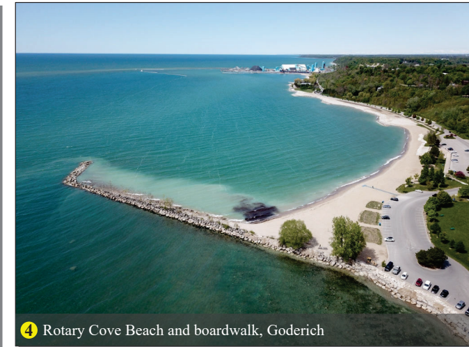
4 Rotary Cove Beach and boardwalk, Goderich