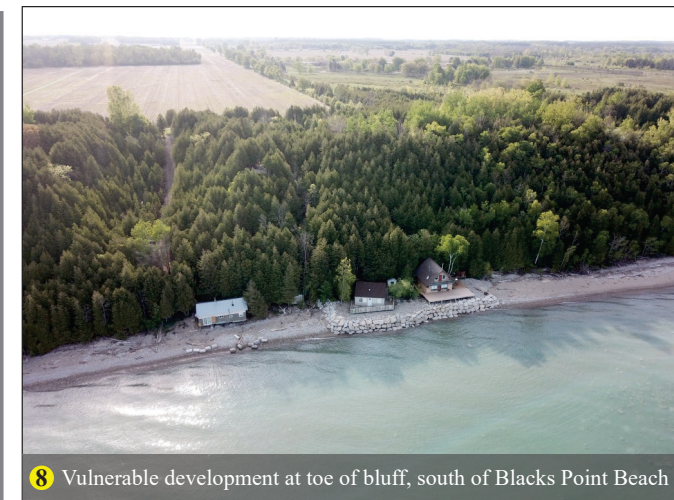
8 Vulnerable development at toe of bluff, south of Blacks Point Beach