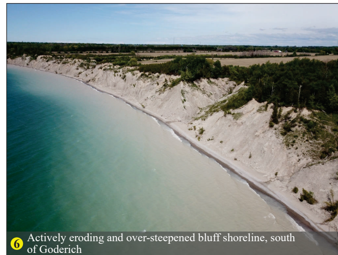
6 Actively eroding and over-steepened bluff shoreline, south of Goderich