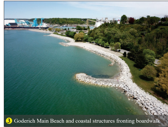
3 Goderich Main Beach and coastal structures fronting boardwalk