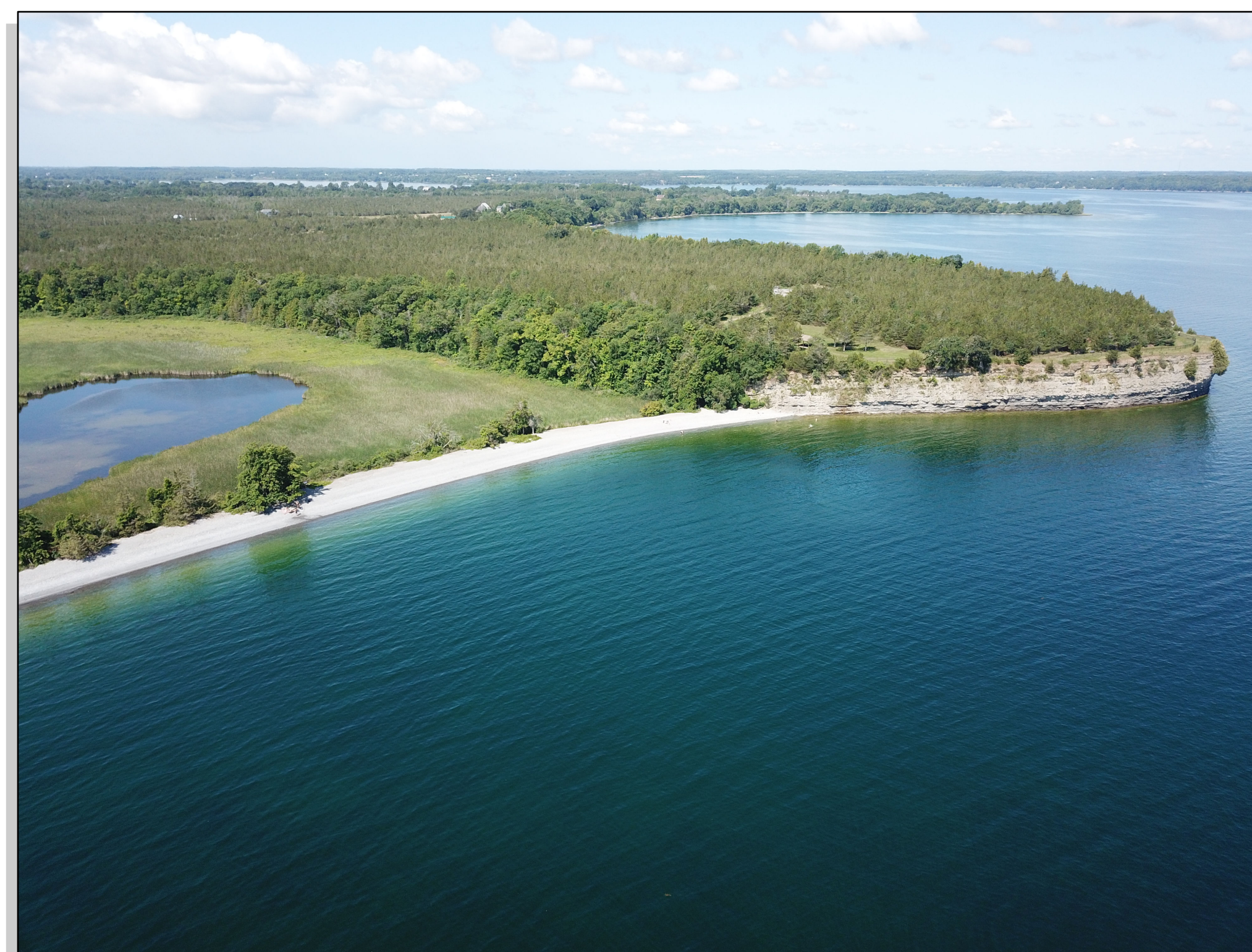
Eroding bedrock headland provides public access to the lake and vistas. Barrier beach comprised of fragmented eroding bedrock (shingle) provides shelter to coastal wetlands.