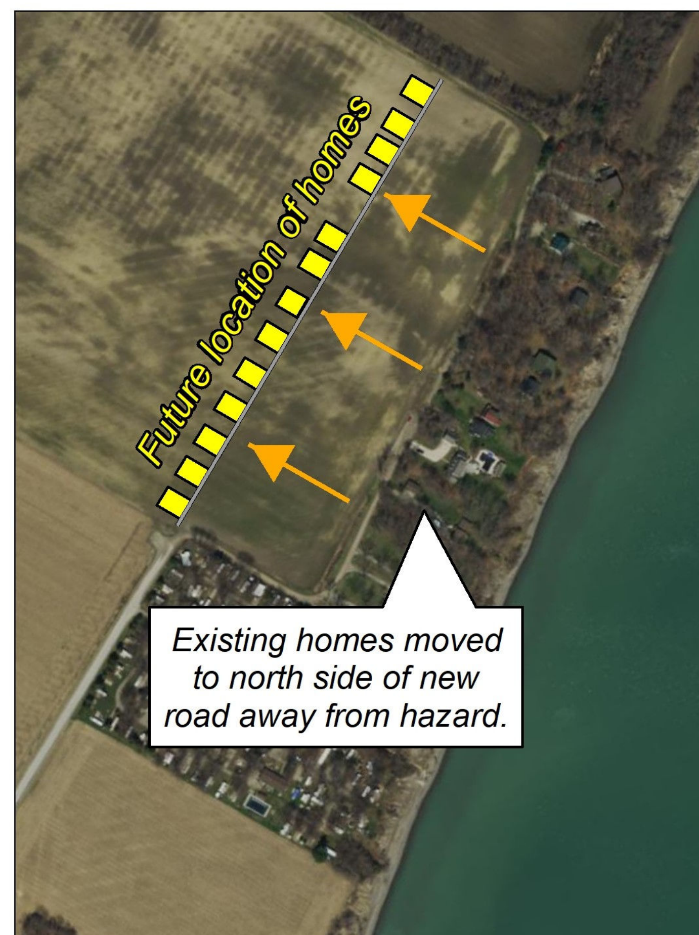
Existing homes moved to north side of new road away from hazard.

Shoreline hazard mapping and risk assessment studies can identify buildings at risk that may be suitable for future relocation.