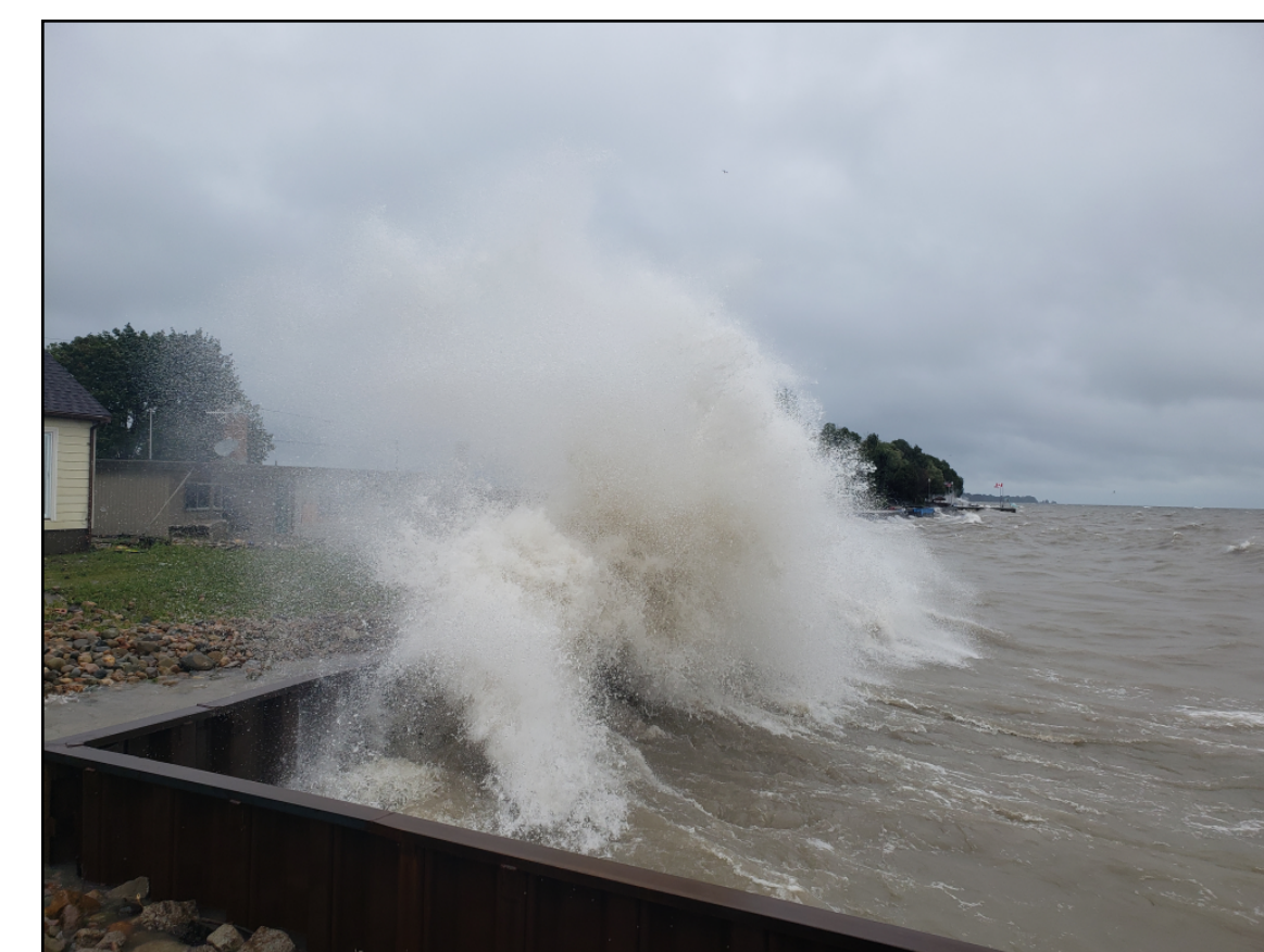
Waves overtopping shore protection which can lead to building damage and flooded roads.