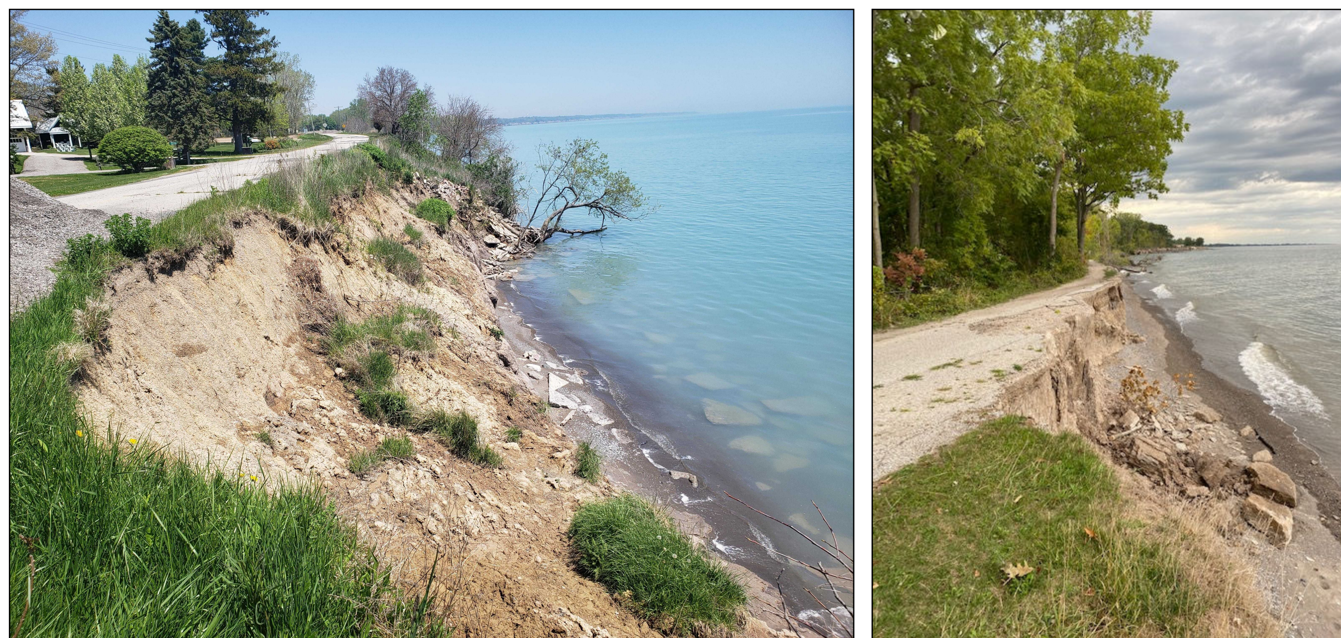
Roads threatened by erosion

The goal of the Re-align strategy is to change land use where public or private assets are exposed to significant risk. It is considered when other PARRAP categories are not sufficient to mitigate the risk or cannot be reasonably implemented due to constructability, permitting constraints, negative environmental impacts or where the cost to mitigate the risk is greater than the assets under threat.