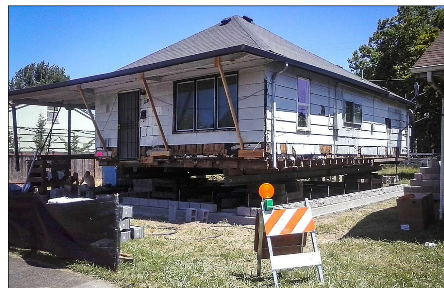
Raise building foundation to reduce flood risk.