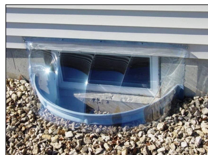
Install window coverings to prevent flood water entry into basement.