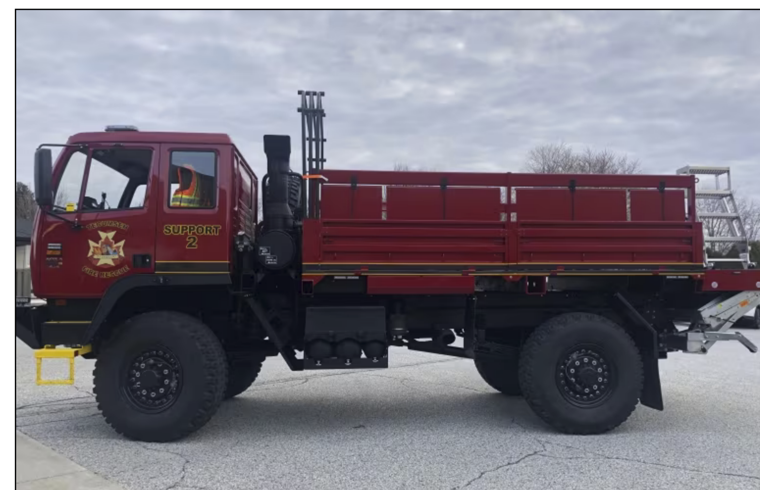
Upgrade emergency vehicles to improve access to flooded streets