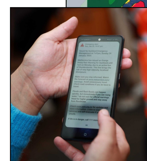
Weather alerts and timely information to help people prepare for threatening conditions.