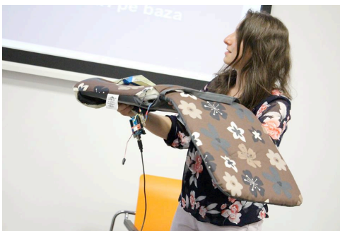
Figure 2, SpiMo prototype

The experiment was conducted with 8 subjects (4 males and 4 females, age 20-50) and for each we have calibrated the pillow and measured different sitting postures. The testers were alerted each time they have changed the postures from good to bad ones or otherwise. As it can be seen in Figure 2, one that tests the smart pillow has a good posture and receives a pop up on the mobile application with the notification. From the one that participated in the testing phase, 65% of them said that SpiMo is a key for a healthier lifestyle, while 35% were not delighted with the idea, because they considered that are too many notifications and in time they can get stressed because of them.