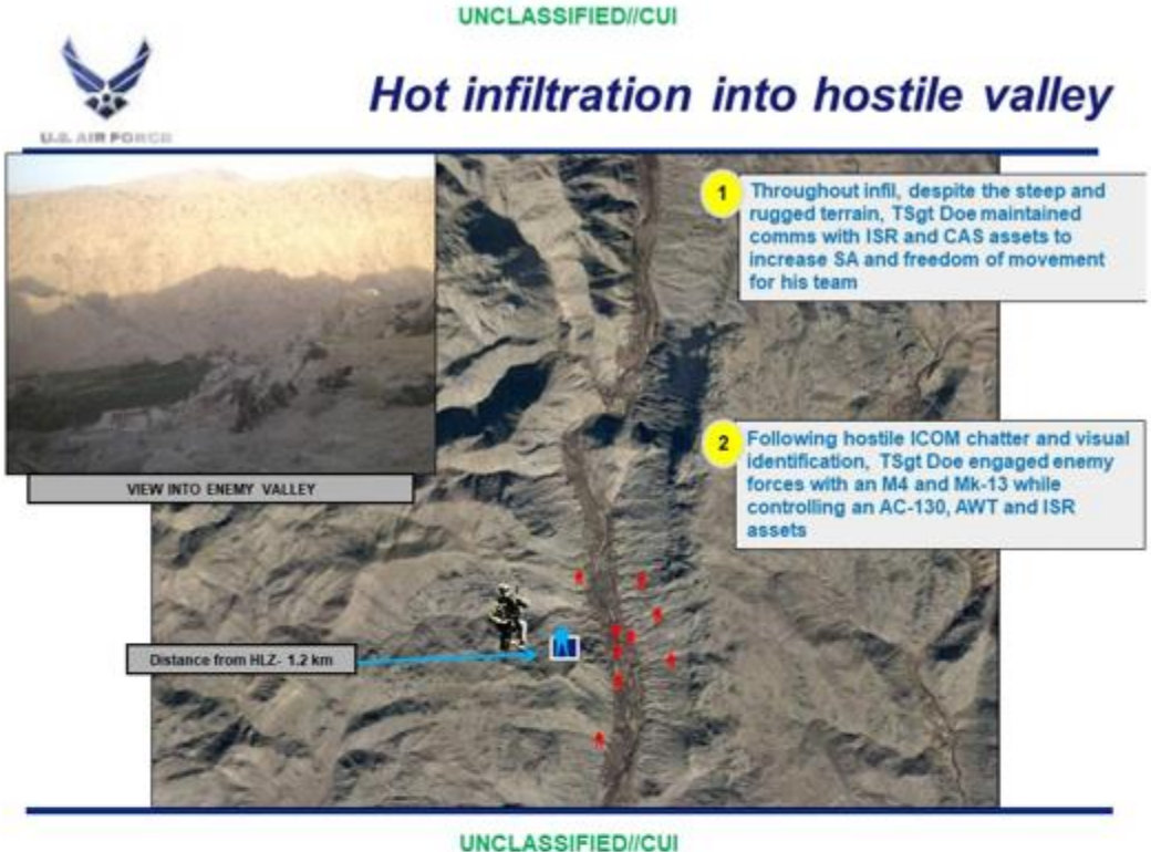
Figure A12.6. Sample Story Board.