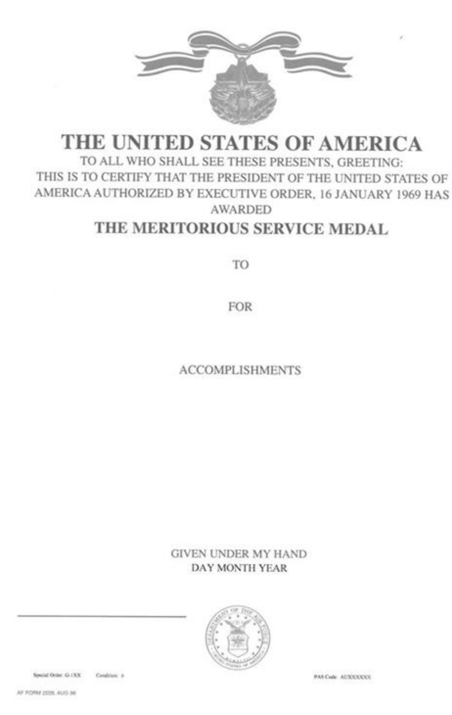
Figure A4.2. Sample of Special Order Information on a Certificate.

A4.6. Distribution of Certificate, Citation, and Order. Distribute copies of the certificate, citation, and special order of approved decorations not processed in the myDecs application (see paragraph 3.3.2 and Attachment 6) immediately, or within 5 working days of approval. Include the recipient's full social security number immediately after the name on the copy that will be