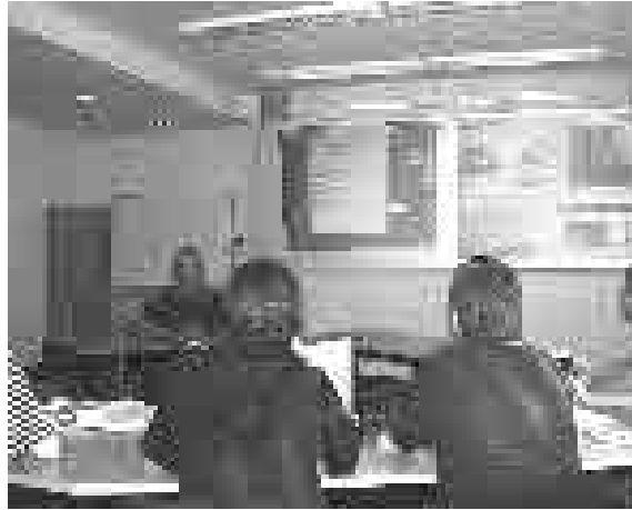
Fig.2 Teaching in Adlershof

we use low-cost hardware and standard software wherever possible. This was a basic economic decision for the whole project design and we find it well justified after more than two years experience.