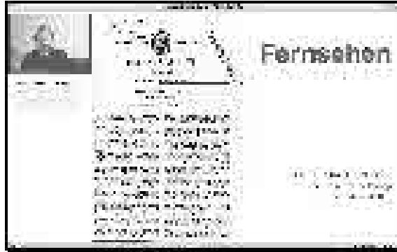
Fig.5 Online- and offline material: PowerPoint slides enhanced by video- and audio-stream