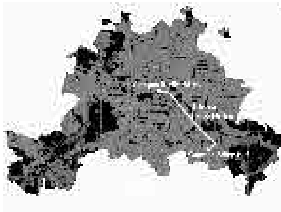
Fig.1 Connecting places; one room is at the main campus in Berlin-Mitte, the other at Berlin-Adlershof. This distance is one hour by inner-city train (S-Bahn).

OZ is a tele-learning environment for lessons, seminars, and exercises in computer science at Humboldt-University, where "OZ" means distributed in space (ortsverteilt) and independent of time (zeitversetzt).