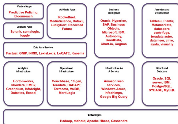
Figure 1. A diagrammatic representation of big data - modularity by service.

Drawing on this conceptualisation, we apply a systemic approach to emerging business models [35] in the financial services sector. We place emphasis on a system-level, layer and modular analysis to explain the type and nature of the business of a series of new emergent companies in the sector. We suggest that in doing so, our approach helps conceptualising not only how value is created, but how it is captured. We show this analysis in section 5, below. Next we consider how to apply this to financial services and the ways we can