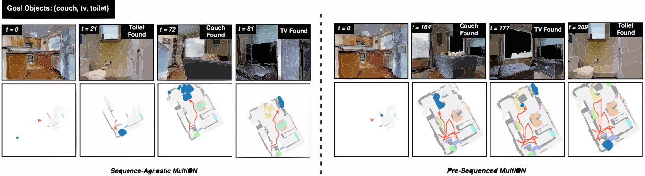
Fig. 3: Qualitative comparison of the performance of our SAM framework (left) with PSM (right) in an episode of the MultiON task with three target object classes (couch, tv, toilet). Our framework results in a smaller number of steps.