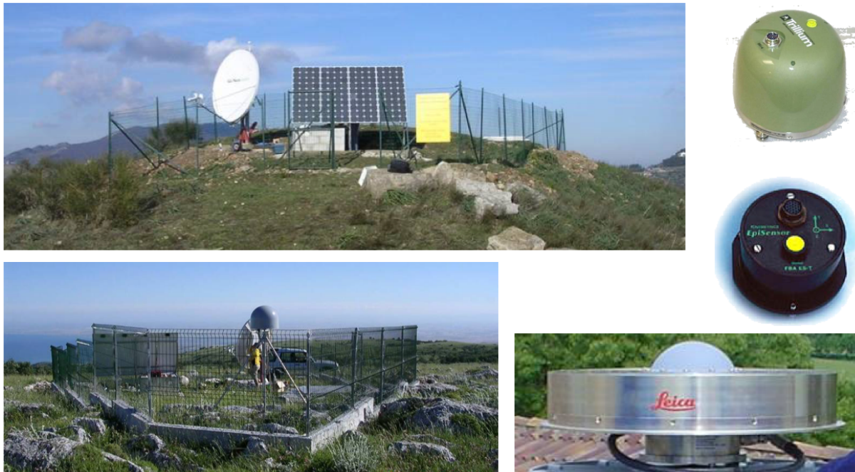
Figure 2. A site of the RSN-RING networks equipped with broad-band velocimeter, accelerometer and GPS antenna.