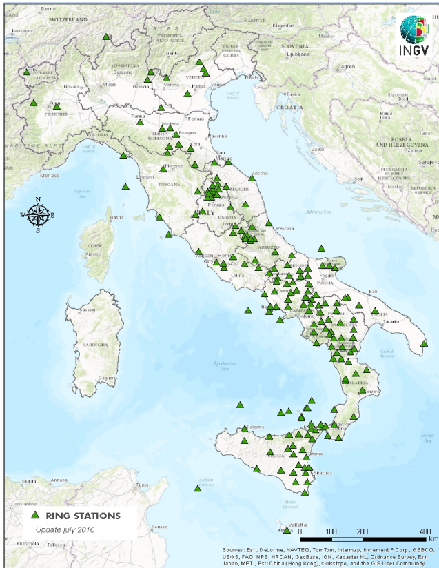
Figure 3. RING, the Italian GPS National network.

node of the federate archive, and develops and provides a series of web services to access, explore and download data and metadata contained in the archive (Fig. 5). EIDA nodes are data centers which collect and archive data from seismic networks. Networks contributing data to EIDA are listed in the ORFEUS EIDA network list ( http://www.orfeus-eu.org/data/eida/networks/ ). Technically, EIDA is based on an underlying architecture developed by GFZ to provide transparent access to data of all nodes. Formally, EIDA is a special working group of ORFEUS – the organization that since 1987 started to promote digital seismology in Europe in all aspects, especially the research of seismic waves in a broad frequency range (so called “broad-band seismology”).