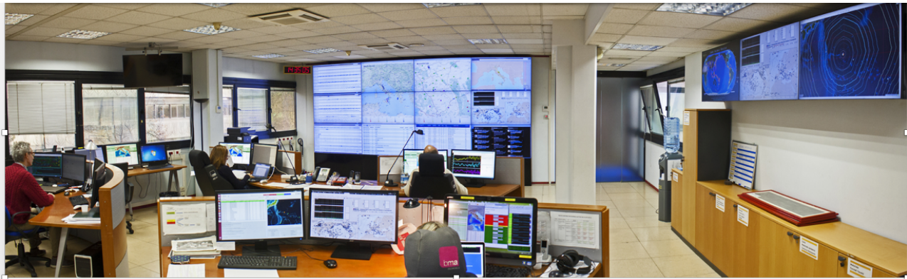
Figure 6. Surveillance, operational room in Rome.