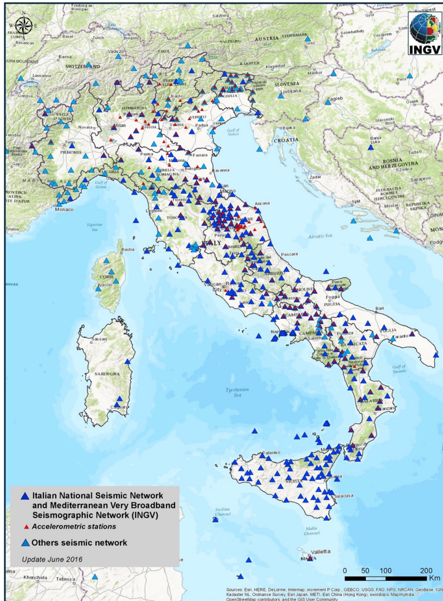
Figure 1. The Italian seismic network, RSN, dark blue triangles are the stations belonging to IV and MN networks directly owned and managed by INGV, light blue triangles are stations owned and managed by other national and international institutions that contribute to the INGV surveillance system. Red small triangles indicate stations equipped with accelerometers.

seismic strain accumulation on faults to the radiative part during the rupture process. Almost all the stations have been installed in the free field thank to the low power consumption of the satellite transmission that can be run with solar panels. Many RING GPS remote sites transmit data at 30 s of sampling rate in real-time streaming adopting the Nanometrics LIBRA VSAT technology and using the Intelsat and Hellasat satellite systems. The satellite communication for the transmission of the geodetic signal has been chosen for its autonomy, reliability, simplicity, possibility to have high quality of data and economy. As an alternative to the satellite