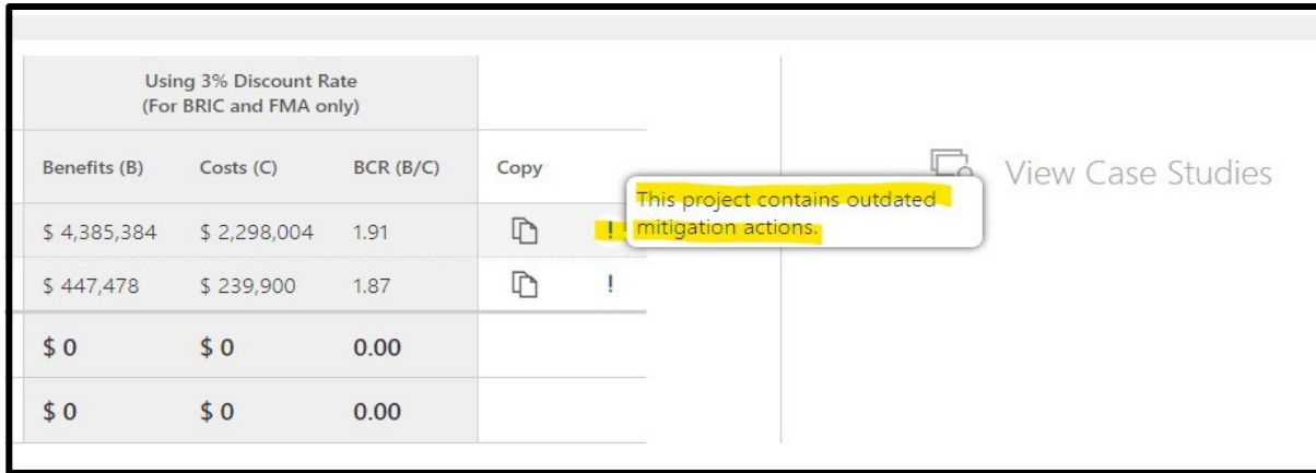
Figure 1: Screenshot from the BCA Toolkit showing notification that underlying values have been updated

To update a previously created project with the new discount rate: