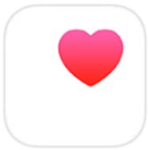
iPhone health app

The iPhone medical ID feature comes already on the current system for iPhone. You do not have to download it from the app store. You can set it up using the Health app.