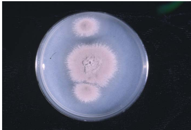
Figure 1. Macroscopic structure of case isolate after 2 weeks' incubation at 25°C on potato flakes agar, prepared in house.

In vitro 48-hour to 72-hour MIC data in µg/mL for the isolate were as follows: amphotericin B, >16; 5-flucyto-